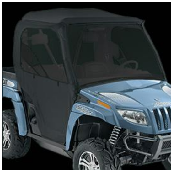
SOFT CAB KIT